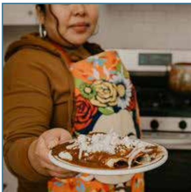
Cooperativa las Cazuelas

Cooperativa las Cazuelas (The Casserole Cooperative) is a women-led co-op that offers homemade Mexican popup dinners monthly in Geneseo. They return this summer to the Perry Farmers Market to give demonstrations and samples of fresh, delicious Mexican foods. GLOW Traditions will accompany them with sales of a new cookbook from the Genesee Valley Council on the Arts, Stories That Cook: Art, Memories, and Recipes .