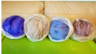
Stardust Acres Fiber