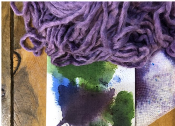
Not Afraid to Dye with Tami Fuller