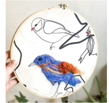
Paint with Wool with Tami Fuller